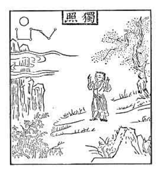
9. The Solitary Moon

The beast all in white now is surrounded by the white clouds, The man is perfectly at his case and care-free, so is his companion; The white clouds penetrated by the moon-light cast their white shadows below, The white clouds and the bright moon-light-each following its course of movement.