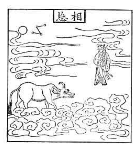
8. All Forgotten

The beast all in white now is surrounded by the white clouds, The man is perfectly at his case and care-free, so is his companion; The white clouds penetrated by the moon-light cast their white shadows below, The white clouds and the bright moon-light-each following its course of movement.