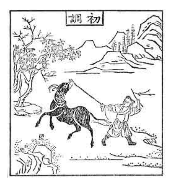
2. Discipline Begun

I am in possession of a straw rope, and I pass it through his nose,