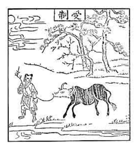
3. In Harness

The beast resists the training with all the power there is in a nature wild and ungoverned, But the rustic oxherd never relaxes his pulling tether and ever-ready whip.