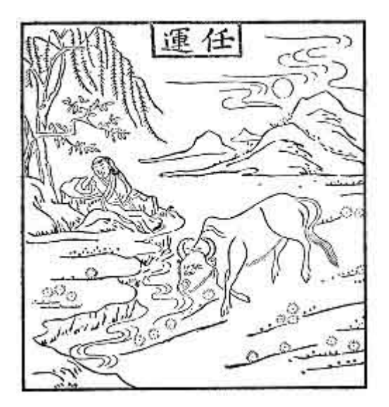
7. Laissez Faire

On the verdant field the beast contentedly lies idling his time away, No whip is needed now, nor any kind of restraint; The boy too sits leisurely under the pine tree, Playing a tune of peace, overflowing with joy.